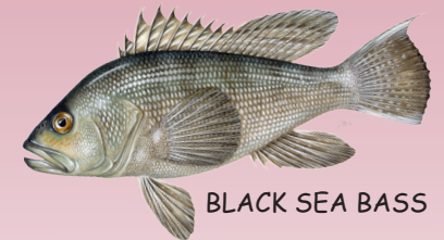
BLACK SEA BASS