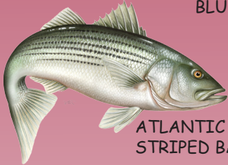
ATLANTIC STRIPED BASS