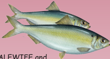
ALEWIFE and BLUEBACK HERRING