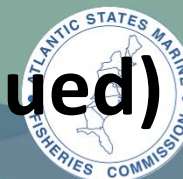
NJ 2015 Black Sea Bass Example Option 3