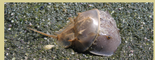
Molting juvenile.

Earlier this year, three Senators and six Representatives requested that NOAA Fisheries incorporate the survey into the agency's annual budget. This long-term funding solution would ensure the resources are in place for the survey for years to come. We are deeply grateful for the support of Senators Chris Coons (D-DE), Tom Carper (D-DE), Cory Booker (D-NJ); and Representatives Frank Pallone (D-NJ), Frank LoBiondo (R-NJ), Lisa Blunt-Rochester (D-DE), Donald Norcross (D-NJ), Chris Smith (R-NJ), and Bill Pascrell (D-NJ) for their help in restoring the Trawl Survey and their dedication to the sustainable management of this important resource.