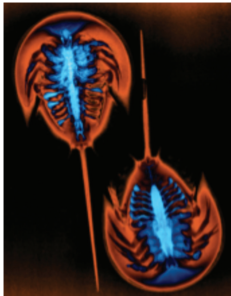
X-ray image of two horseshoe crabs showing the difference in the distribution of blood between a bled crab (left) and an unbled crab (right).

One of the goals of the UNH/Plymouth State research has been to determine the relative impacts of each of the stressors on the physiology and behavior of horseshoe crabs. The researchers collected crabs in the Great Bay Estuary, New Hampshire, exposed them to different combinations of air exposure, heat, and bleeding, and then measured changes in both their activity