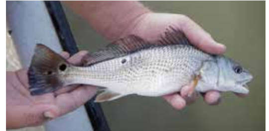
Juvenile red drum captured as part of Georgia DNR's young-of-the-year survey.

The Commission's South Atlantic State-Federal Fisheries Management Board approved two addenda – Addendum I to the Omnibus Amendment to the Interstate Fishery Management Plans (FMPs) for Spanish Mackerel, Spot, and Spotted Seatrout and Addendum I to Amendment 2 to the Interstate FMP for Red Drum.