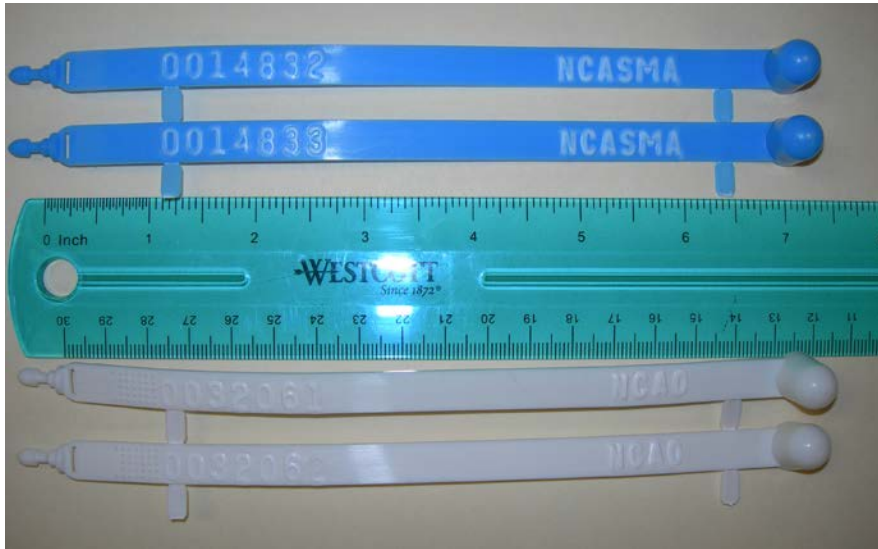
Figure 10. 2012 Commercial striped bass tags for North Carolina. Tags are seven inches in length. Blue tags (top) are valid for harvest in the Albemarle Sound Management Area. White tags (bottom) are valid for harvest in the Atlantic Coast off of North Carolina.