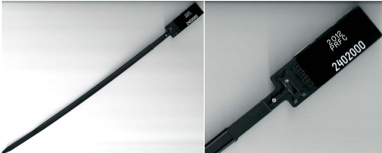
Figure 8. 2012 commercial tag from Potomac River Fisheries Commission. Tags are 13.5 inches in length. Tag shown (in black) is for the haul seine gear. Refer to Table 5 information on tag color scheme for other gears.