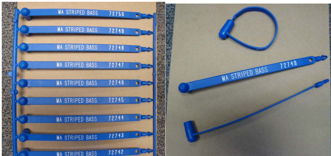
Figure 3. Example of commercial striped bass dealer tags for Massachusetts. Dealers are required to attach a tag to any striped bass shipped to a state that with tagging requirements.

Commercial fishermen are required to accurately report their catch at the trip-level, including the location, dealer sold to, and quantity of all striped bass harvested during the open season and their monthly trip-level reports shall be filed no later than the 15 th of the following month. Failure to complete and submit accurate and timely trip-level reports or falsification of any such report may result in a non-renewal of the striped bass endorsement. In 2010 there were 3,951 permitted striped bass commercial fishermen.