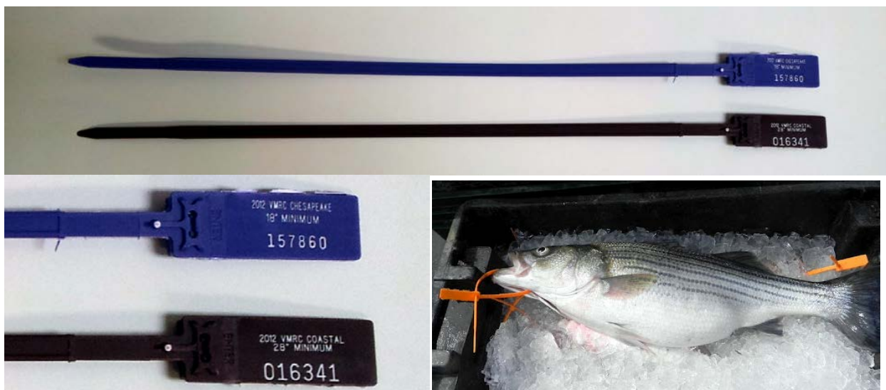
Figure 9. 2012 commercial striped bass tags from the Virginia Marine Resources Commission (top). Blue tag (top tag in bottom left photo) is valid for harvest in Virginia's portion of the Chesapeake Bay. Black tag (bottom tag in bottom left photo) is valid for harvest in the Atlantic Ocean off of the Virginia coast. An example of a legal sized commercially tagged striped bass in Virginia in 2011 (bottom right photo).

Any fisherman that has used all their allocated tags but has unused striped bass commercial quota can request additional tags from VMRC, after providing accounting for all previously issued tags. All fishermen are required to return all unused tags from the previous commercial season to VMRC within 30 days of harvesting their individual harvest quota, or by the second Thursday in January, whichever comes first. Any unused tags that cannot be turned in to the commission shall be accounted for by the harvester submitting an affidavit to the commission that explains the disposition of the unused tags that are not able to be turned into the commission. Each individual shall be required to pay a processing fee of $25, plus $0.13 per tag, for any unused tags that are not turned in to the commission. This report must be submitted prior to receiving the next season's commercial tag allotment.