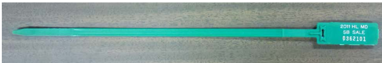
Figure 7. Maryland hook and line commercial striped bass fishery for 2011. Tags are inscribed with the year, gear code, state, fish code and a unique number.

All tags shall be securely affixed through the mouth and one gill opening immediately upon harvest by hook and line, within 200 yards of the pound net from which the striped bass was harvested from or before removing a striped bass from a boat or removing a boat from the water for all other gears. Only striped bass tags issued by the Department may be on board a vessel while engaged in fishing for striped bass in the Chesapeake Bay and its tidal tributaries. An allocation permit and striped bass tags for only one fishing-gear type may be on board a vessel at any one time. Current regulations require that any fillets be accompanied by a tag until sale to the final consumer.