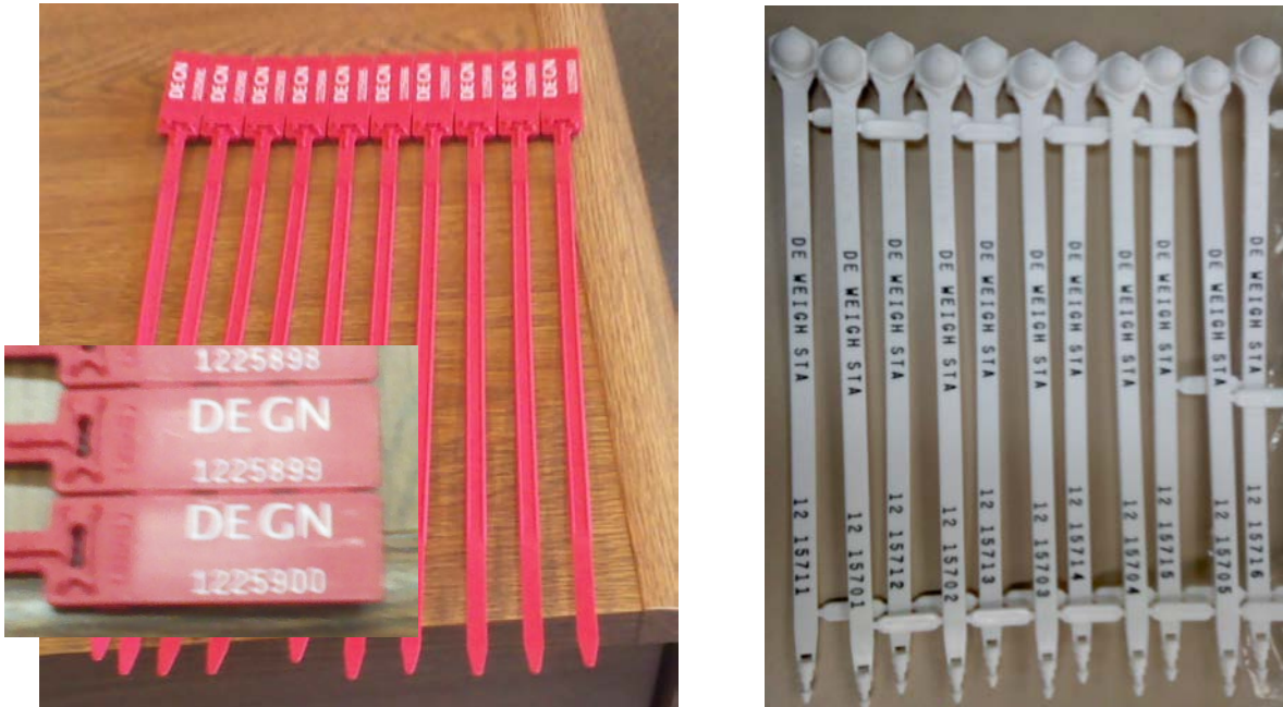
Figure 6. Striped bass tags for Delaware. Delaware regulations require commercial fishermen to tag striped bass with their allocated commercial striped bass tags (left). Tags are inscribed with state, approved gear and a unique identification number. Commercially caught striped bass must also be weighed and tagged (right) at a weigh station. The fishermen and weigh station tag colors change annually.

Each commercial fisherman participating in a striped bass fishery is required to file a harvest report to DDFW detailing all striped bass landed within 30 days after the end date of the fishery. All unused tags issued or legally transferred must be returned with the report. Failure to file an acceptable report or failure to return all unused tags may disqualify the commercial fishermen from future striped bass fisheries.