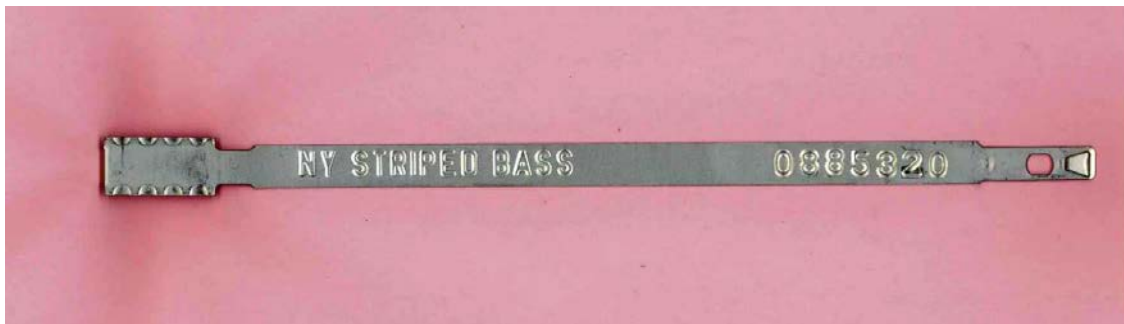
Figure 5. 2008 striped bass tag for New York. Tags are 8.5 inches in length. The metal tags are imprinted with a seven digit code which designates the year (first two digits) and the serial number (last five digits). Tag colors do not change annually.

It is unlawful to sell or offer for sale untagged striped bass or striped bass fillets or steaks unless the tagged carcass from which such fillets or steaks were removed is present and available for inspection. Possession of untagged striped bass or striped bass fillets or steaks without the properly tagged carcass in establishments where fish are sold or offered for sale (including wholesale establishments, retail establishments and restaurants) is presumptive evidence of intent