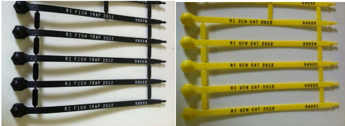
Figure 4. 2012 commercial striped bass tags for Rhode Island. Tags are 8.25 inches in length. Black tag (left) is valid for harvest with a “Fish Trap” permit. Yellow tag (right) is valid for harvest under a “General Category” permit. Tag colors change annually.

Floating trap landings are reported three times a week. General category fishermen have no reporting requirements; however dealers purchasing general category striped bass are required to report through SAFIS twice a week. The license or permit of any individual who fails to report required information in a timely fashion or who files a false report shall be subject to suspension or revocation. No application for a license renewal will be accepted from a person who has failed to submit reports in a timely fashion.